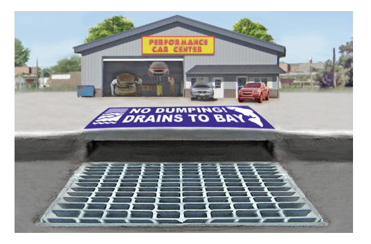
Storm Drain: An outdoor drain that flows directly to creeks and the Bay.

If your shop has floor drains, contact your local sanitary sewer treatment agency for requirements for discharging to the sanitary sewer.