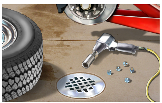
Sanitary Sewer Drain: An indoor drain that flows to the Sewage Treatment Plant.