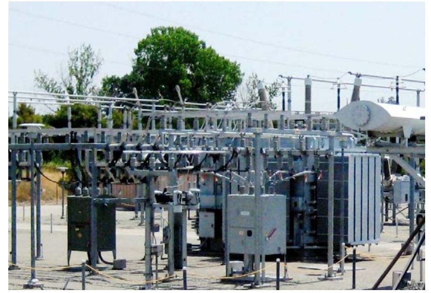
Electrical Substation near Stanley Boulevard in Pleasanton

An electric power system consists of power plants, transmission lines, distribution substations, and distribution lines. Currently, the Tri-Valley's electric power is supplied by a combination of private suppliers which sell power to PG&E for resale. Electric power is stepped up to higher voltages<sup>1</sup> at the generating source to allow power to be delivered over a number of wires. The electricity is transported via a network or grid of high-voltage transmission lines.