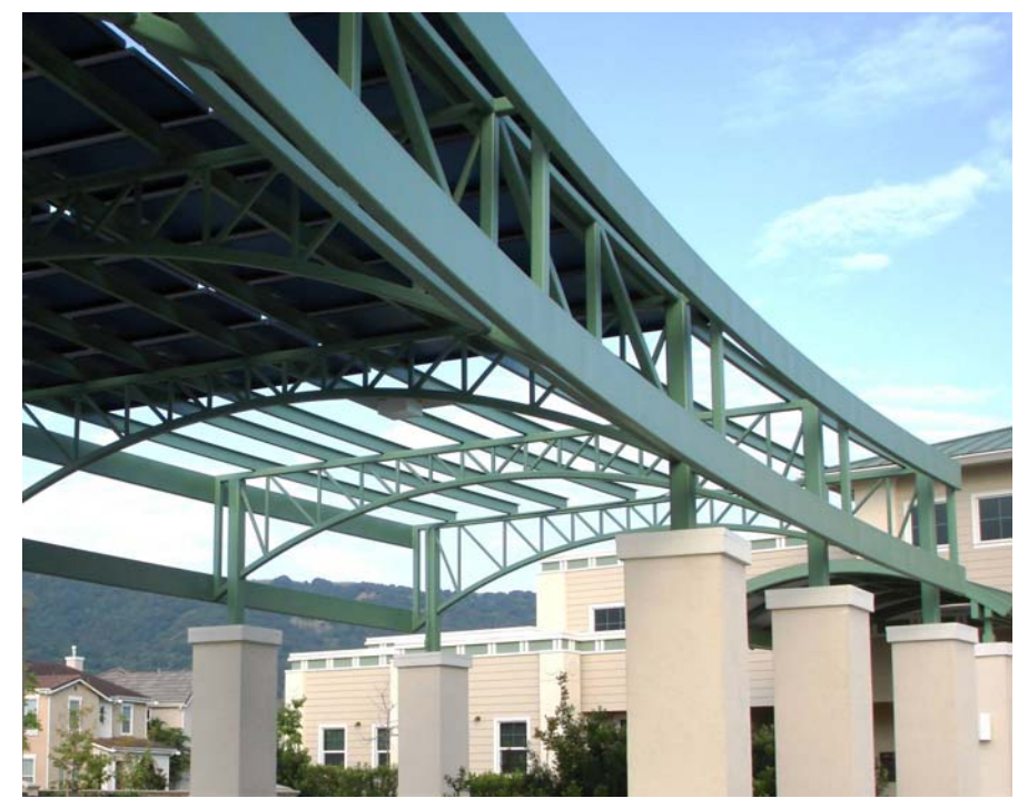
Solar panels on the green structure power Pleasanton Fire Station 4

The purpose of the Energy Element is to guide Pleasanton toward a sustainable energy future. We define the term "a sustainable energy future" as development that meets the needs of the current generation without compromising the ability of future generations to meet their needs. The current energy system is dependent upon energy resources drawn from the natural environment, many of them non-renewable. In contrast, a sustainable city draws from the environment only those resources that are necessary and that can be used or recycled perpetually, or returned to the environment in a form that nature can use to generate more resources.