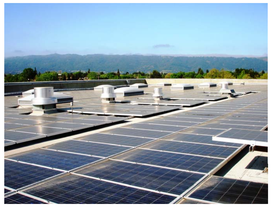
Solar panels on the roof of Borg Fencing

with the overarching goal of the Energy Element which is to guide Pleasanton toward a sustainable energy future. Passive solar energy design is also suitable for Pleasanton. Passive solar energy techniques do not employ mechanical means to utilize heat or light from the sun, but instead employ strategic building and landscaping placement as well as building design to naturally heat and cool buildings.