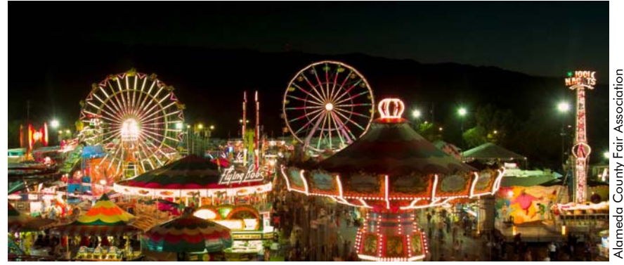
Alameda County Fairgrounds at night

The Alameda County Fairground installed a photovoltaic (solarpower) system that produces about 1,200 megawatt hours of electricity annually and provides about 50 percent of the electricity consumed at the Fairgrounds.