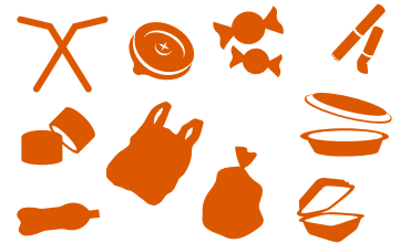
Plastics products account for THE TOP 10 ITEMS COLLECTED during the Ocean Conservancy's International Cleanup event.

While straws themselves are not a significant component of plastic pollution in the ocean, proponents of AB 1884 hope that straws can serve as a “gateway plastic,” encouraging people to forgo other single-use plastics such as bags and bottles, and helping to increase awareness about the environmental impacts of single-use plastics.