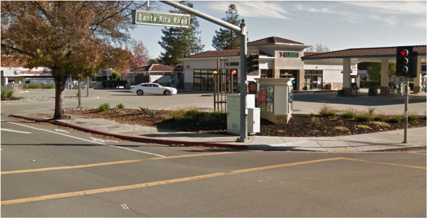
#1. Santa Rita and W. Las Positas