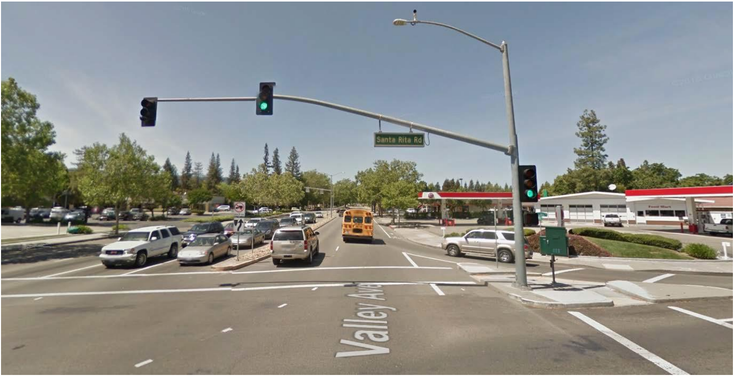
#3 Santa Rita and Valley