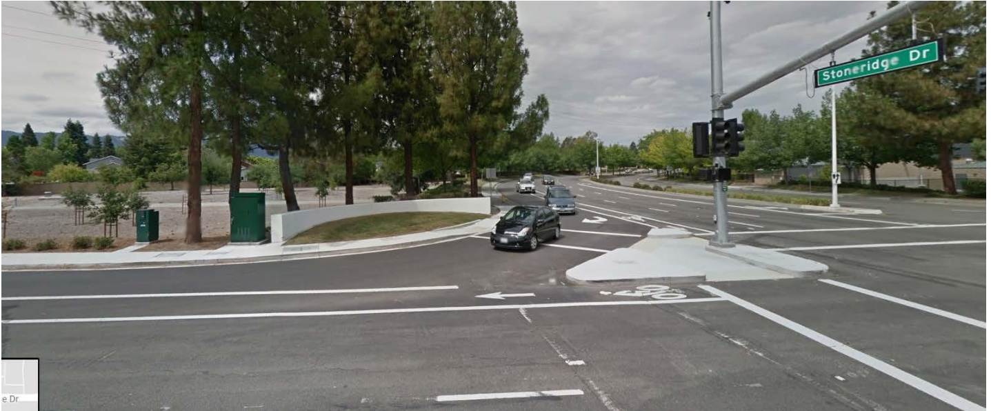
#2 Santa Rita and Stoneridge