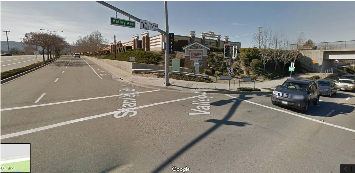
#4 Stanley and Valley