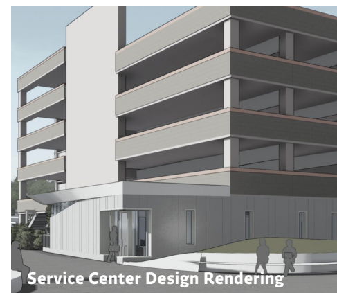
Service Center Design Rendering

by the working group, which includes the City of Pleasanton, BART, and Workday. This facility will have a prominent presence at the new Workday campus; strategically located on the corner of the existing BART parking garage near the future passenger drop off area, the entry to the Workday campus, and the bridge path to the West Dublin/Pleasanton BART station.